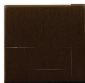
Bronze Satin Stainless