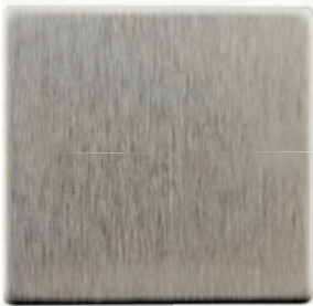
Satin Stainless Steel