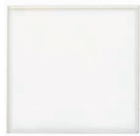
Prism Clear Acrylic

telephone +44 (0) 1634 226666 fax +44 (0) 1634 226667 www.rakocontrols.com