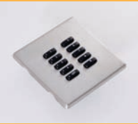
Satin Stainless Steel