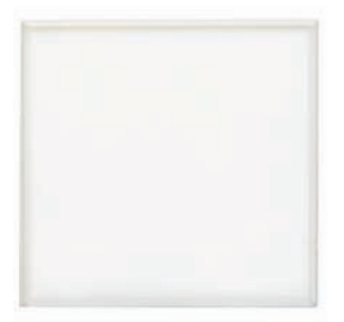
Prism Clear Acrylic