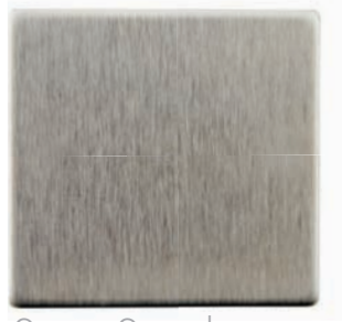
Satin Stainless Steel