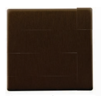
Bronze Satin Stainless